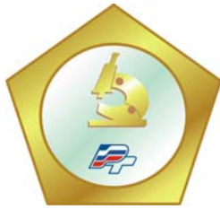
Competition for “Quality Mark” in one of the five nominations