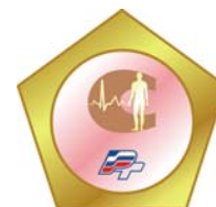
Quality mark of medical equipment using measuring devices